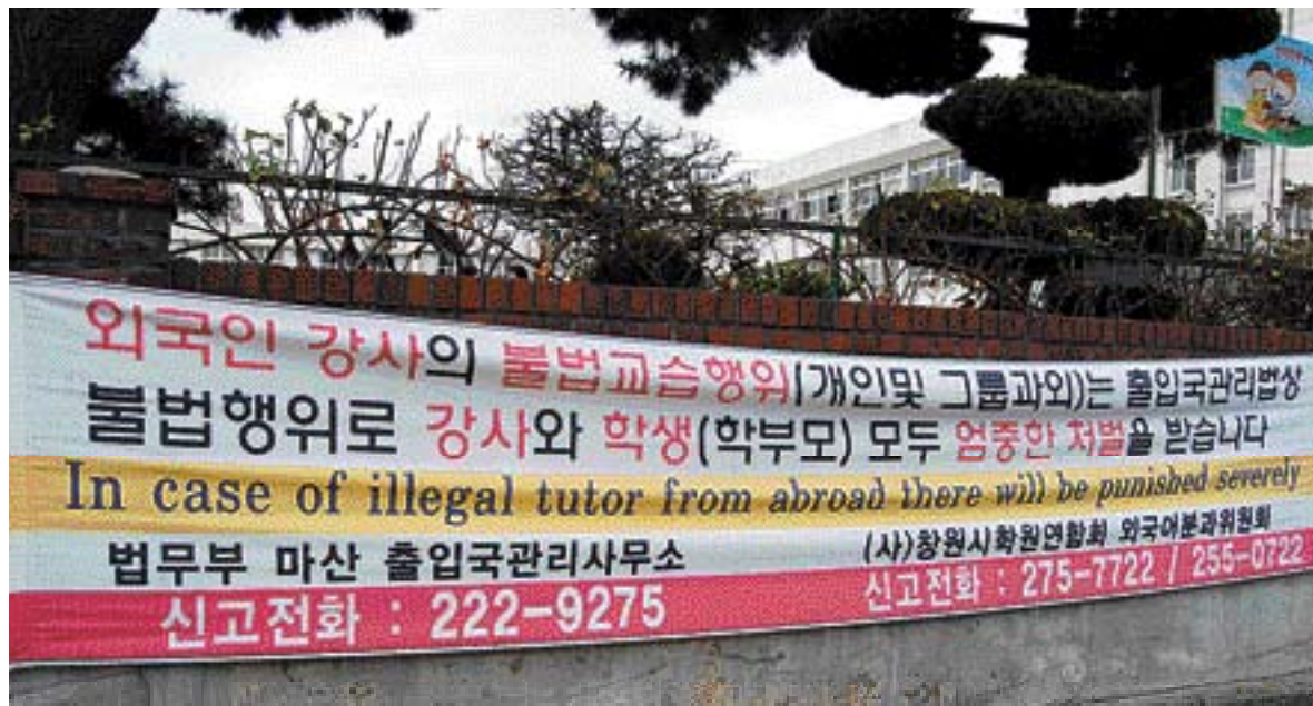
A banner at a primary school in Changwon, South Korea, warns foreign teachers not to work illegally

"Teachers wanting to go to Korea for the first time will be turned off," said